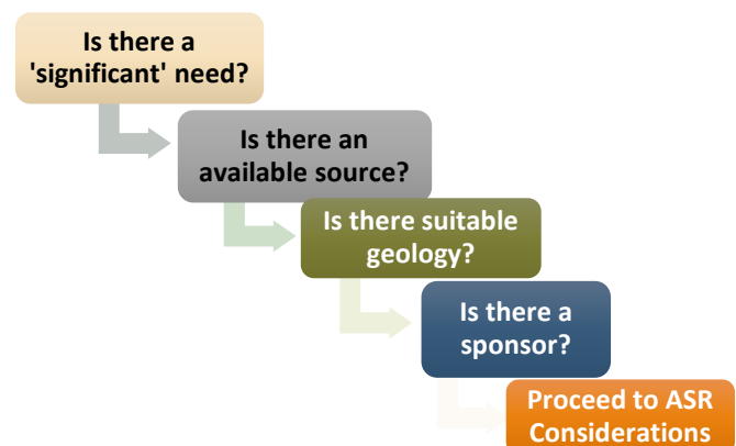
Figure 5-1 ASR Screening Process